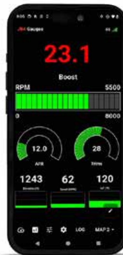
JB PRO App