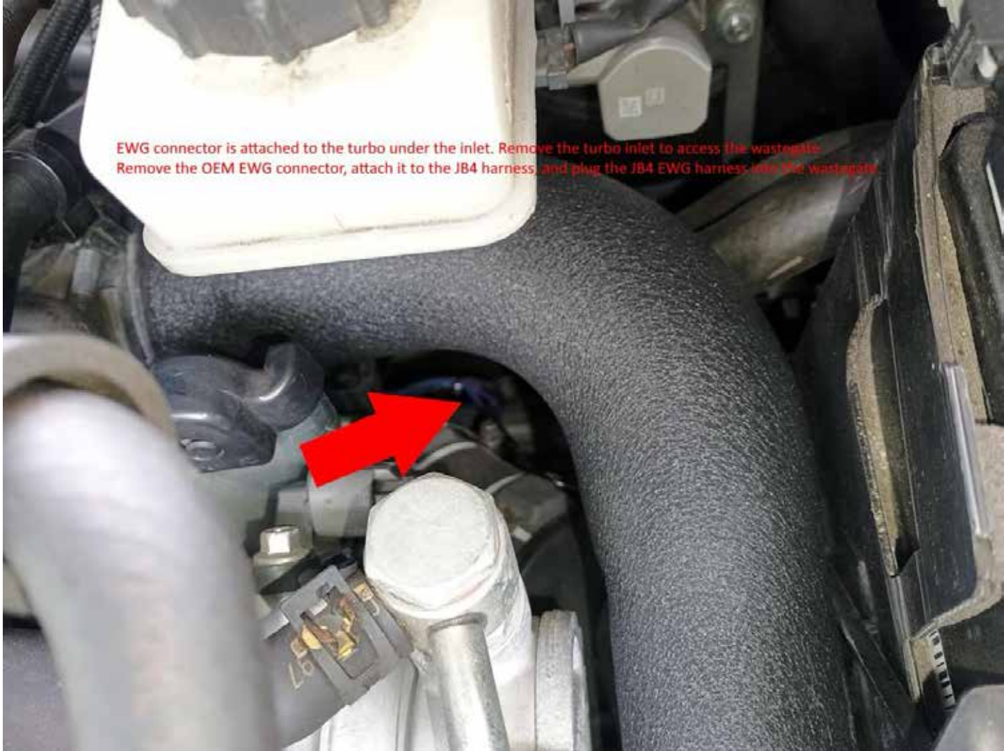
EWG connector is attached to the turbo under the inlet. Remove the turbo inlet to access the wastegate. Remove the OEM EWG connector, attach it to the JB4 harness, and plug the JB4 EWG harness into the wastegate.